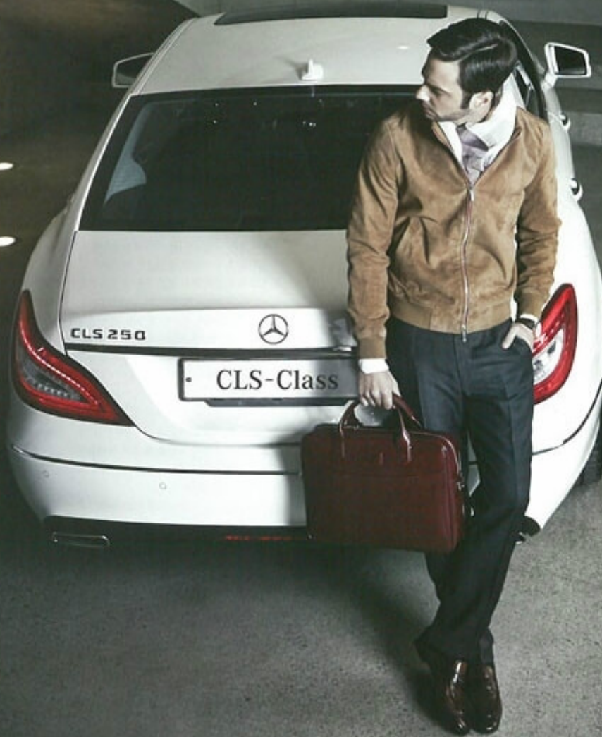
PHOTO: OTO CARACOLEA HA BOBBI PANTS, SUOVI: ENNAUSCUDO D'ORNA, SCARPE: PAULINA TISSIP, BAG: E.T. DUPONT PARIS, WATCH: LUCSSE MARCON