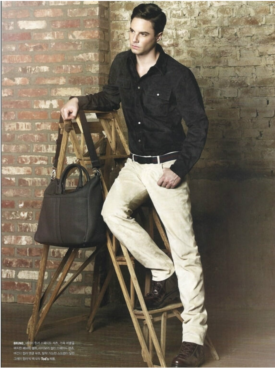
BRUNO, 내추럴 컬러 스퀘어드 셔츠, 가죽 버클을 매치한 레너드 벨트, 아이보리 컬러 스퀘어드 팬츠, 매건디 컬러 벨트 부츠, 알약 가방형 스토퍼가 달린 그레이 컬러 백팩 모두 Tod's 제품.