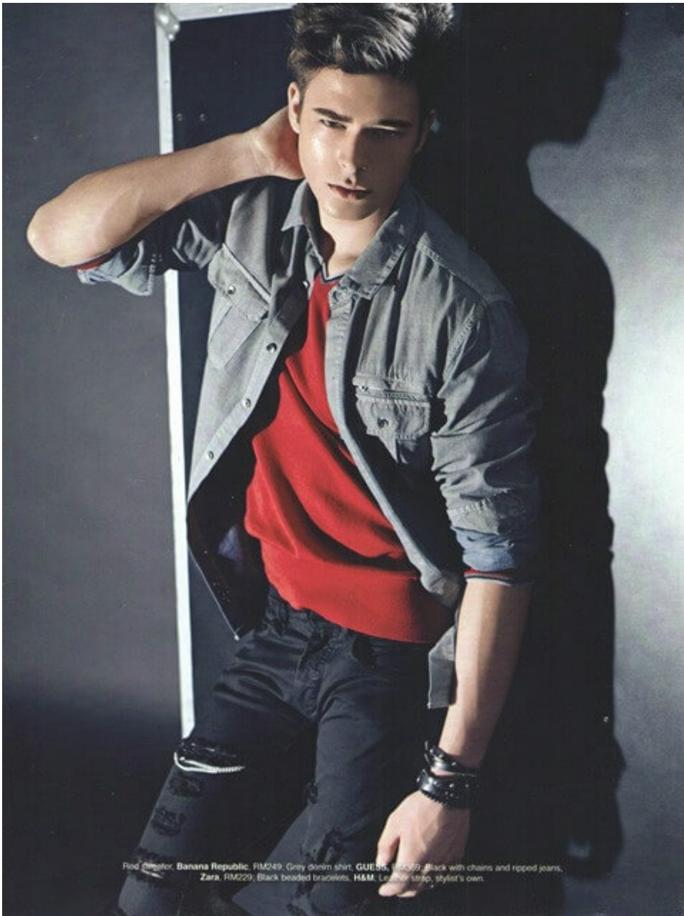
Rod Caster, Banana Republic, RM249; Gray denim shirt, GUESS, RM369; Black with chains and ripped jeans, Zara, RM229; Black beaded bracelets, H&M; Leather strap, stylist's own.