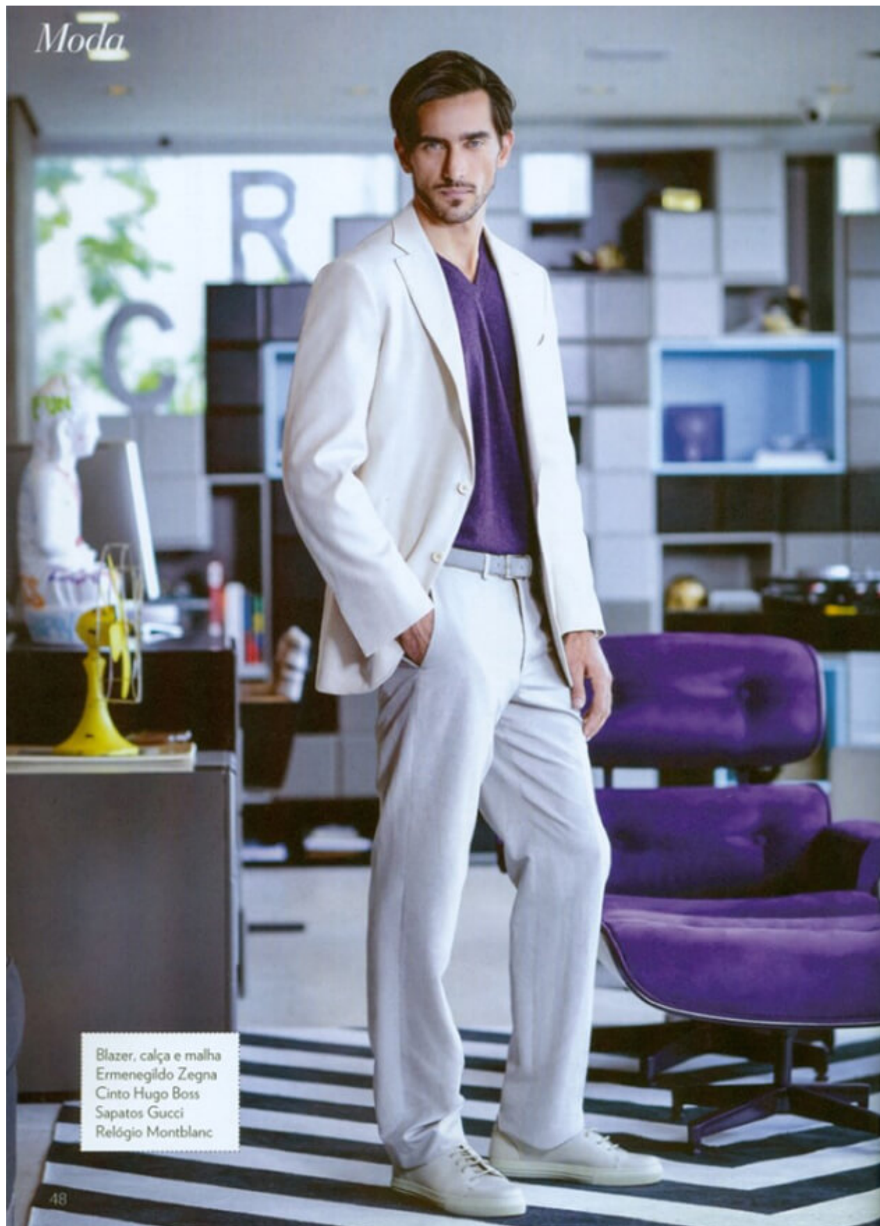
Blazer, calça e malha Ermenegildo Zegna Cinto Hugo Boss Sapatos Gucci Relógio Montblanc